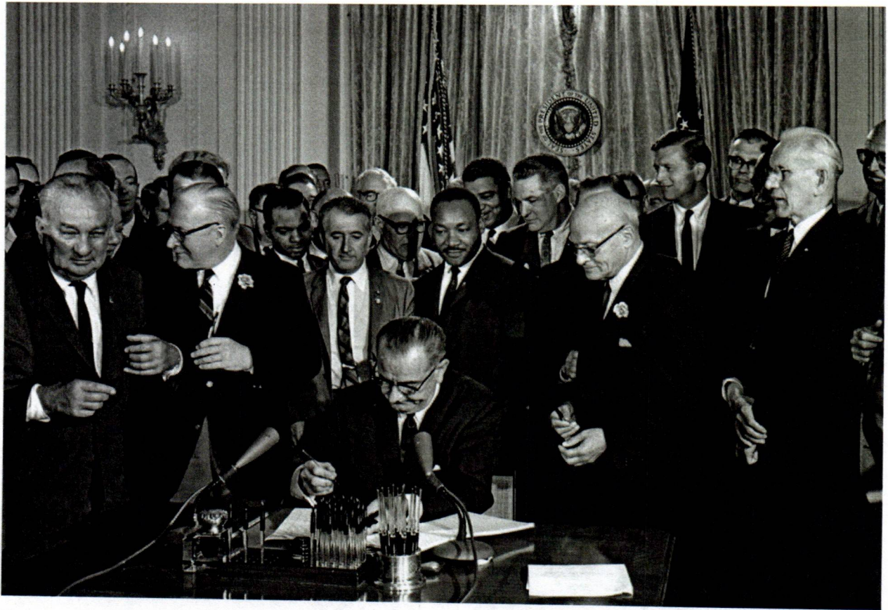
President Lyndon B. Johnson signing the Civil Rights Act of 1964